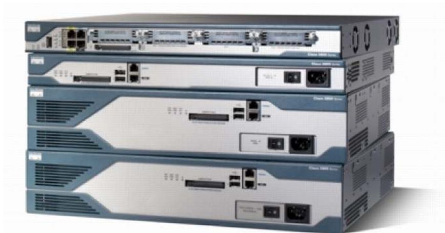
Figure 1. Cisco 2800 Series

Cisco Systems ® , Inc. is redefining best-in-class enterprise and small- to- midsize business routing with a new line of integrated services routers that are optimized for the secure, wire-speed delivery of concurrent data, voice, video, and wireless services. Founded on 20 years of leadership and innovation, the Cisco ® 2800 Series of integrated services routers (refer to Figure 1) intelligently embed data, security, voice, and wireless services into a single, resilient system for fast, scalable delivery of mission-critical business applications. The unique integrated systems architecture of the Cisco 2800 Series delivers maximum business agility and investment protection.