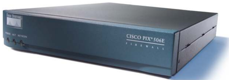
Cisco PIX 506E Security Appliance