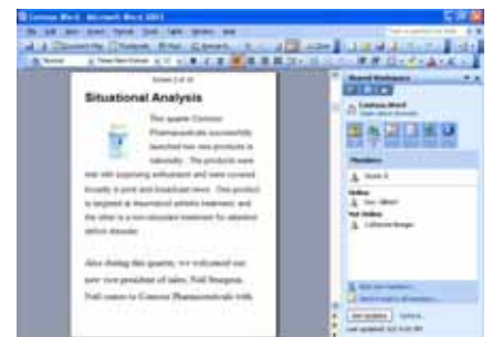
Shared workspace task panes help to coordinate team-related information.

view document properties. You can use the Shared Workspace Task Pane in Outlook 2003 e-mail messages, Word 2003 documents, PowerPoint 2003 presentations, and Excel 2003 spreadsheets. 1