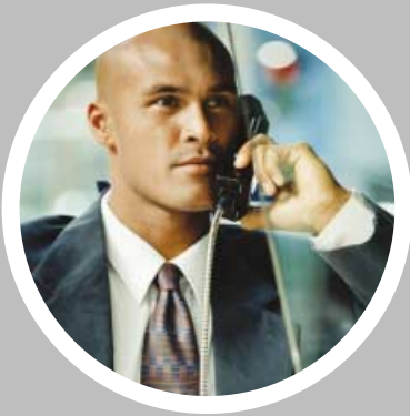
Real Toll-Quality Voice