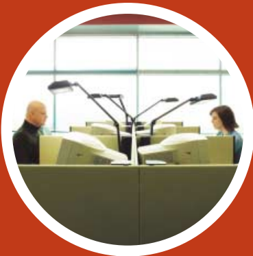
Multiple PC access without affecting voice service