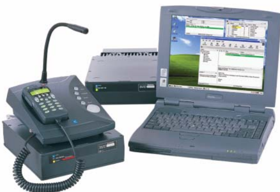
UUPlus Email for HF software with Codan HF equipment

Channel selection is automated by presetting up to 5 channels in the UUPlus software, or utilising the Codan Automated Link Management (CALM) feature of the transceiver.